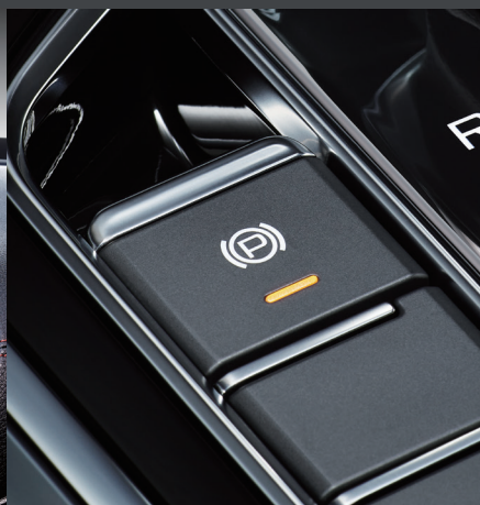
All series of EPB Electronic Parking System