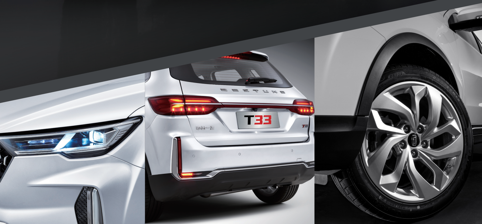
LED head lights