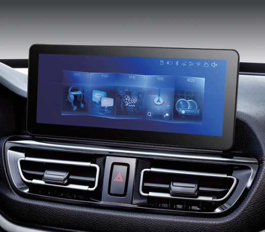
Non-pointer LCD instrument panel