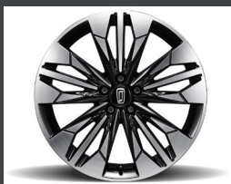
18-inch dual color wheel hub