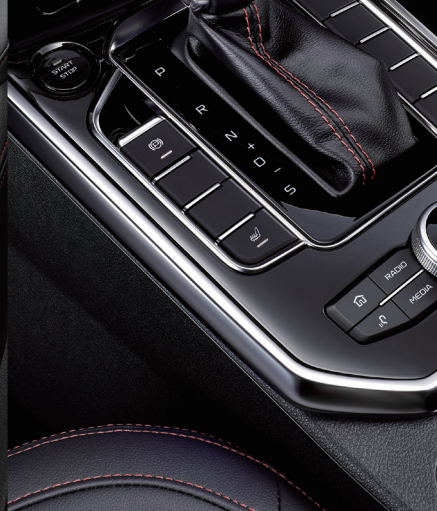
Aixin new third generation six speed manual integrated gearbox