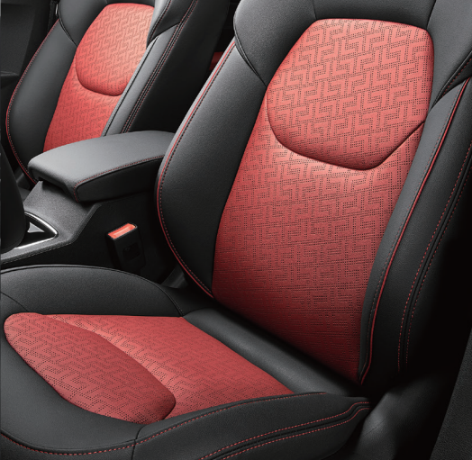
Comfort & Safety