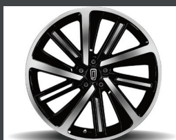
19-inch dual color wheel hub