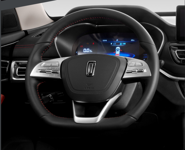
3 spoke multifunction steering wheel